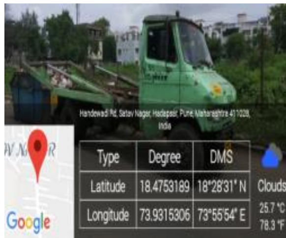
PMC Van in campus to collect waste