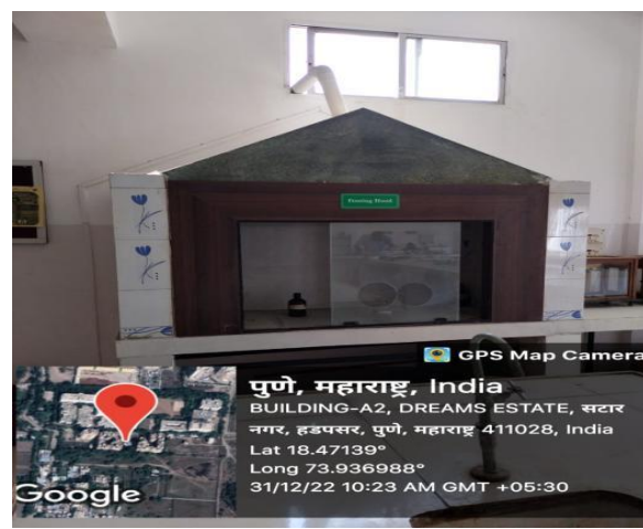
Hazardous chemicals management using Fuming Hood