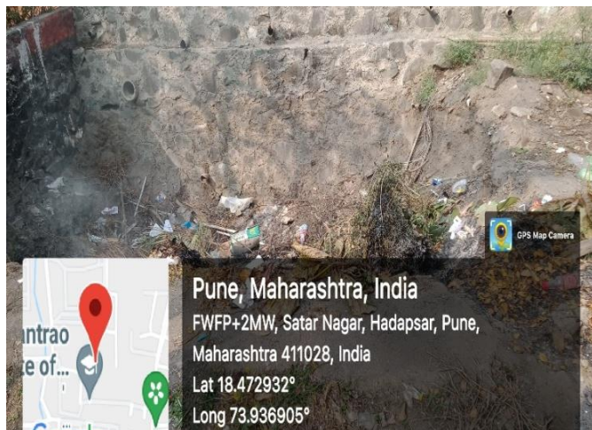
Photograph of Bio Composting Plant