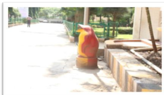
Waste collection bins in campus