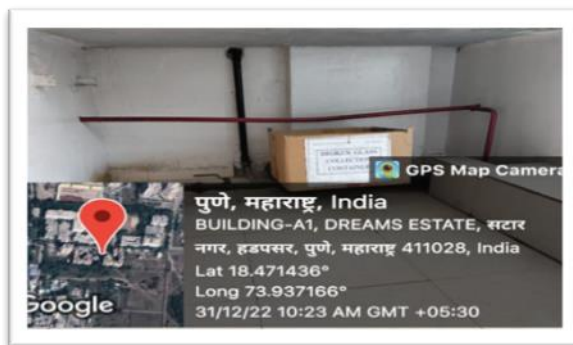
Photograph of Waste Collection Bins at college