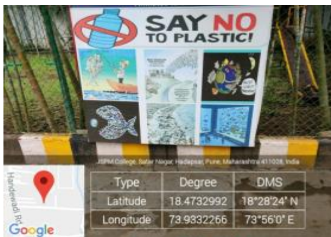
Plastic free campus