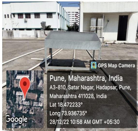
Solar Distillation Unit