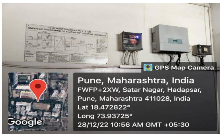
Wheeling to the Grid