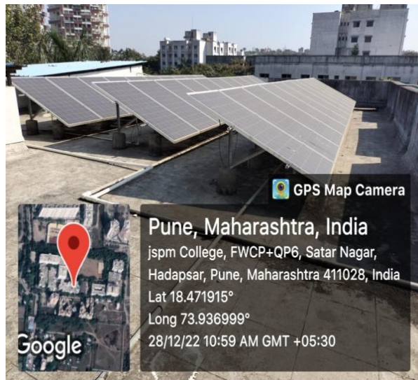
Roof top Solar System